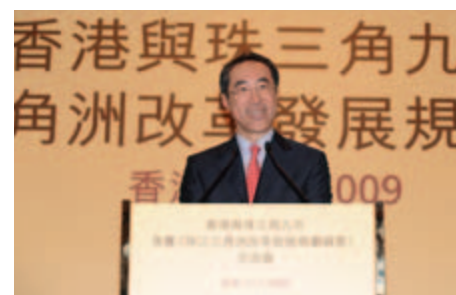
Mr Henry Tang, the Chief Secretary for Administration of HKSAR, attends Forum on Implementation of "The Outline of the Plan for the Reform and Development of the Pearl River Delta Region" on 21 July 2009

Besides transportation, Hong Kong and other PRD municipalities have been collaborating on upgrading the secondary production and expediting development of the tertiary production with a view to enhancing the competitiveness of the PRD region. Hong Kong and PRD are also cooperating in improving the environment to make the region a more pleasant and greener place to live. Significant improvements