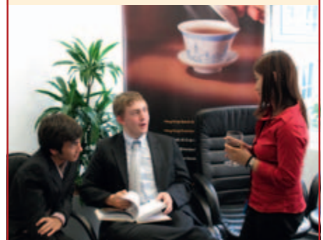
Students (1st and 2nd from left) from the German Swiss International School Hong Kong sharing with staff of HKETO, Berlin during their visit in Berlin in June 2009

service orientation of the Hong Kong people and the renowned blending of eastern and western culture.