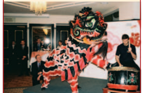
Dragon dance at the Chinese New Year reception in Warsaw in March 2008