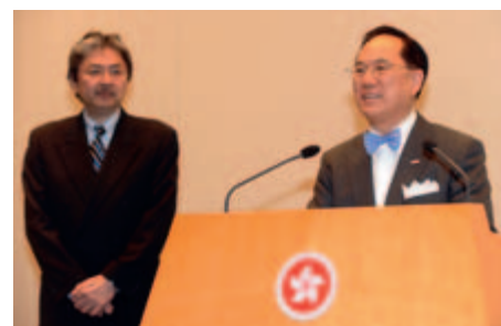
Mr Donald Tsang, the Chief Executive of HKSAR, announcing recommendations by the Task Force on Economic Challenges in promoting the development of six priority industries

In the past few months, the TFEC has studied six priority industries which are new engines for economic growth in a knowledge-based economy. They are medical services; educational services; testing and certification; innovation and technology; cultural and creative industries; and environmental industries. These industries will complement Hong Kong's four pillar industries of financial services, producer and professional services, trading and logistics, and tourism. Combined, they will form a more solid