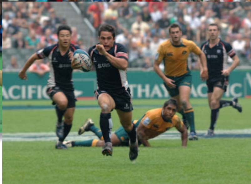
Athletes from other countries competing in Hong Kong at the East Asian Games