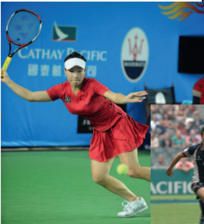
Tennis as one of the sports to be held at the 2009 East Asian Games