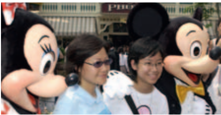
Mickey and Minnie welcoming visitors

Since its opening, HKD has received more than 17 million visitors. Survey data from the Hong Kong Tourism Board indicated that these visitors to HKD had generated an additional spending of HK$17 billion in Hong Kong, over and above what would have been spent without the theme park. Taking into account both the direct and indirect value added generated from this additional spending, HKD has brought about EUR 1 billion of value added to the Hong Kong economy in the past three years. This has raised GDP by an average of 0.2% each year. The additional spending of visitors to HKD has created more than 10,000 jobs in terms of man-years in each of the past three years.